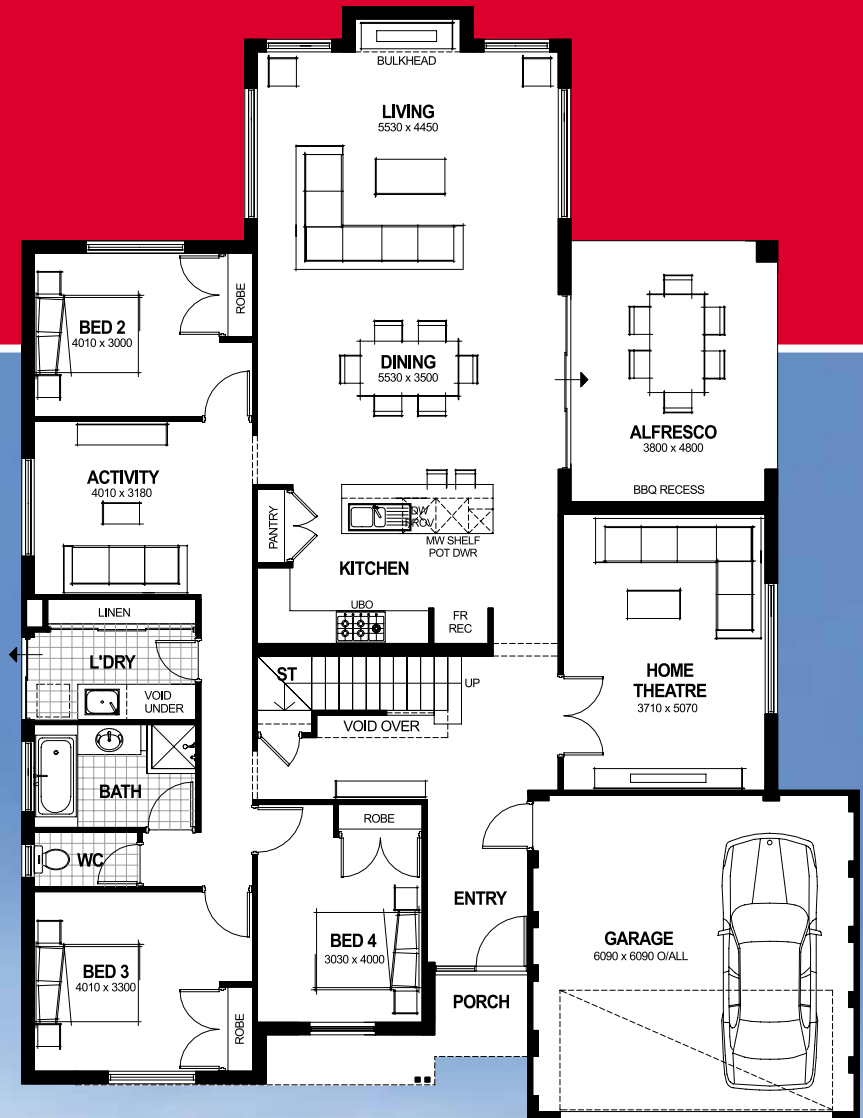
Ground Floor Suits 17m frontage